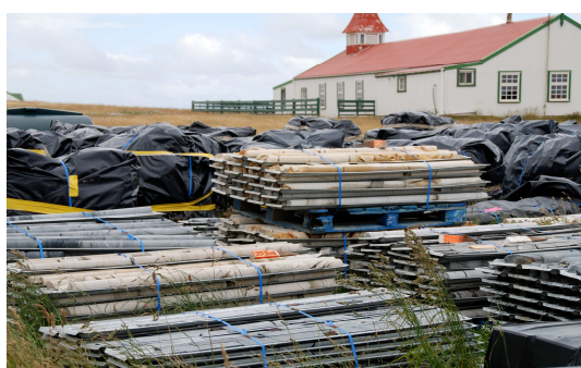
Core extracted during FGMLs drilling programme stored at Goose Green

The Mineral Resources Department is extremely grateful to Phil for securing funding and returning to the Islands to undertake this project. Thanks also to everyone who has donated packing materials to ensure that the core can be transported safely and to BAS who donated specimen boxes for the core and agreeing to transport the core back to the UK.