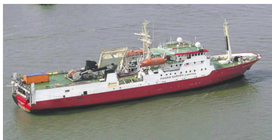
MV Fugro Meridian

Fugro Survey limited, using the vessel M/V Fugro Meridian, will undertake seabed sampling commencing in mid December. A Marine Mammal Observer will be on board for the duration of the survey.