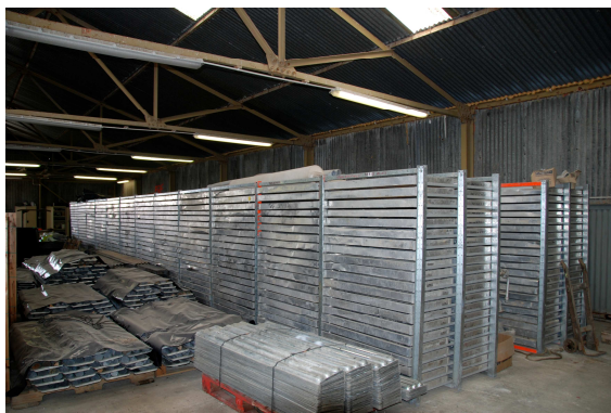
Core stored inside the Transit Shed at Goose Green