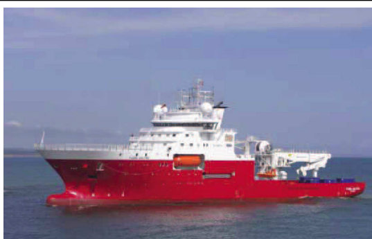
MV Fugro Saltire

In January, Fugro-McClelland Marine Geoservices, from the vessel M/V Fugro Saltire, will take geotechnical borings of the seabed in order to examine shallow geology over the prospect areas.