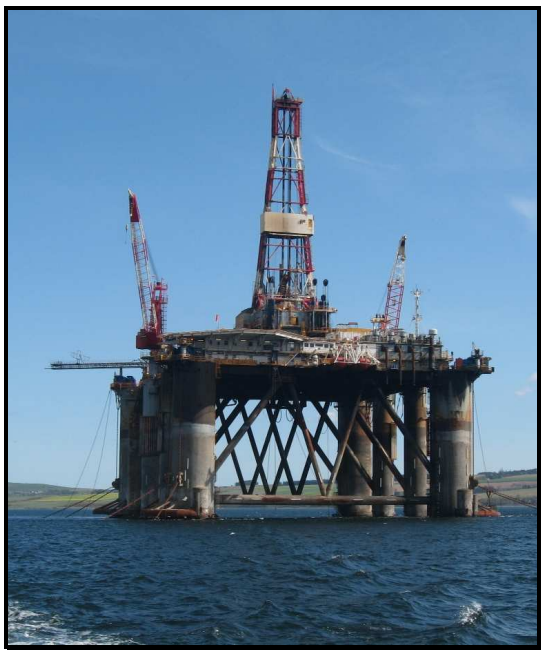
The Ocean Guardian in Invergordon prior to departing for the Falklands

Semi-submersible drilling rig Ocean Guardian (above) has begun its journey to the Falklands and is expected to arrive in late January, with drilling scheduled to begin on February 1 st . Desire Petroleum plans to drill a minimum of four wells, while Rockhopper Exploration will drill two. The campaign is expected to last between 6 to 8 months.