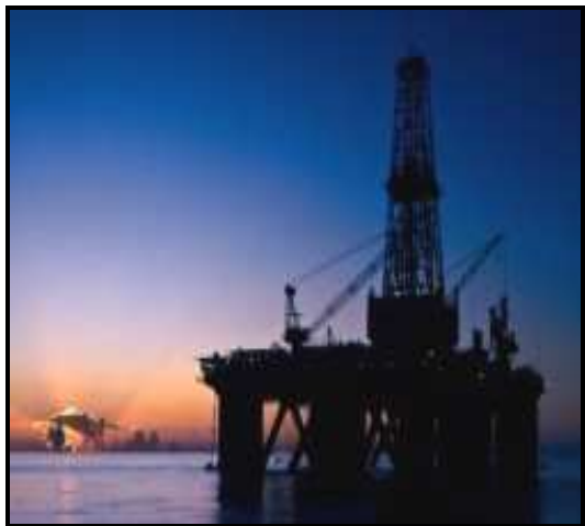
The Ocean Guardian in the North Falkland Basin.

On the 6 th May, Rockhopper Exploration announced that initial data from the Sea Lion prospect (well FI 14/10-2) indicated an oil discovery, which is the first in the North Falkland Basin. Additional data acquired through logging confirmed that they had encountered a good reservoir with 53m of net pay in multiple zones. Further testing will need to be undertaken in order to confirm whether or not the discovery is commercial. Rockhopper is now planning to suspend the well for further testing.