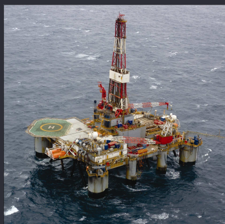
The Ocean Guardian drilling in the Falkland Islands.

Desire Petroleum as contractors for the Ocean Guardian have confirmed that the current well being drilled by Rockhopper Exploration will be the final well for the rig in the Falkland Islands.