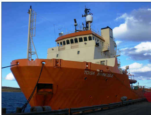
The Toisa Invincible PSV.

The next well 14/10-8, was both to appraise the SLMC and explore for the "Casper" and "Kermit" fans. The well was drilled to a total depth of 2635m and encountered good quality, thick reservoir packages in all three targets. However all the sands were water wet and the well is a dry hole. Rockhopper believe that the reservoir in this well is separated by a fault from the rest of the SLMC, hence the lack of hydrocarbons. However the prognosis for the rest of the field has been upgraded because of the thickness and quality of the reservoir encountered.