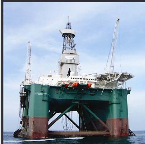
Leiv Eiriksson.

The Ocean Rig 5 th generation semi submersible Leiv Eiriksson has now completed its work for Cairn Energy in Greenland.