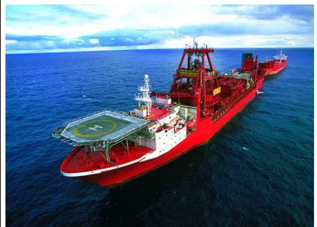
The Petrojarl Foinhaven, an example FPSO

We also had a visit from Peter Dixon-Clark and Paul Culpin from Rockhopper Exploration. They held a public meeting examining the potential development scenarios for Falkland Islands oil fields. The use of Floating Production Storage and Offloading (FPSO) was examined in detail with a field in the West of Shetland as an example.