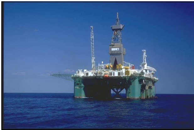
The Ocean Rig - Leiv Eiriksson.

The Ocean Rig semi submersible Eirik Raude which was due to come to the Falklands later this year to drill for Borders and Southern Petroleum and Falkland Oil and Gas Ltd. (FOGL) has been replaced with her sister ship the Leiv Eiriksson . The Leiv Eiriksson has recently upgraded the BOP (Blow Out Preventer) with Casing Shear rams, which will provide the rig with superior capabilities in the event of a well control episode. The Leiv Eiriksson is currently operating in western Greenland and is due to arrive in the Falkland Islands around the end of 2011.