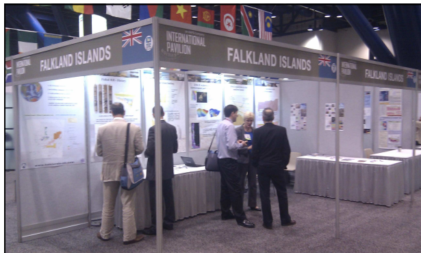
The Falkland Islands stand in the International Pavilion at AAPG

There continues to be a strong interest in the Falkland Islands stand from all areas of the industry.